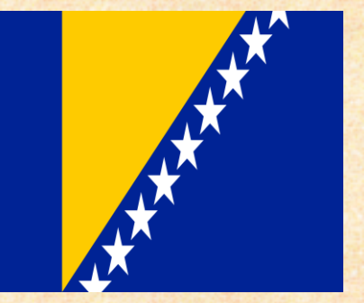
Bosna & Herzegovina